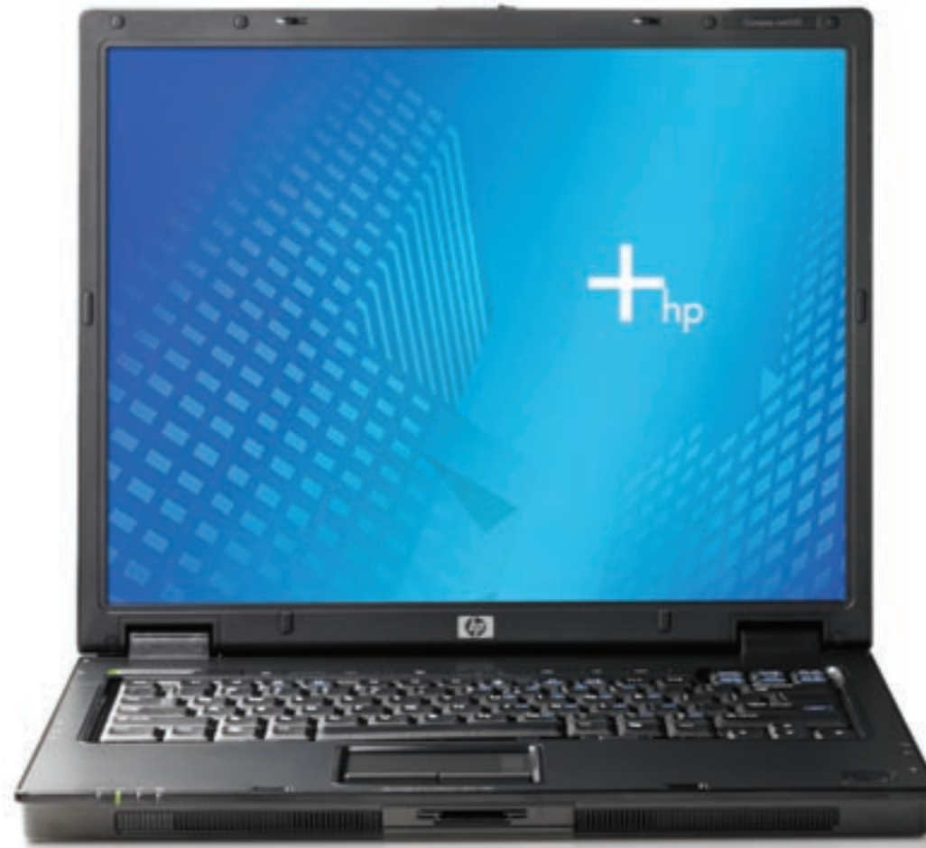
HP Compaq nx6325